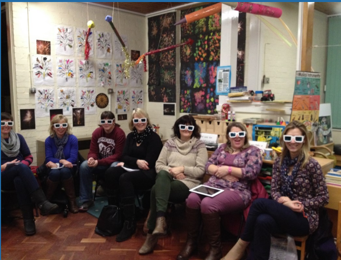
Early Years Partnership Training, Thame Jan 2015