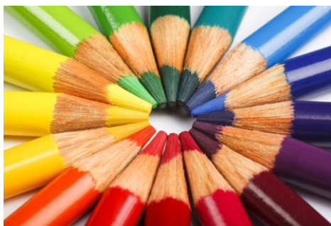
Normal colour vision