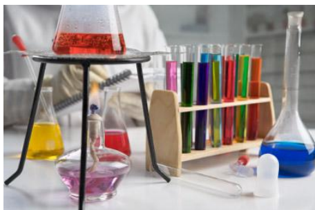
Normal colour vision