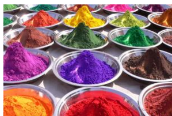
Normal colour vision

There are 3 main types of genetic CVD conditions which can vary from mild to severe forms; protanomaly/protanopia, deuteranomaly/deutanopia and tritanomaly/tritanopia and these terms relate to the three main colour receptors in the eye. Protanopia relates to a red deficiency, deutanopia relates to a green deficiency and tritanopia to a blue deficiency. In all deficiencies, however mild or severe, accurate perception of more than just one colour is affected.