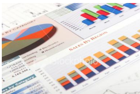
Normal colour vision