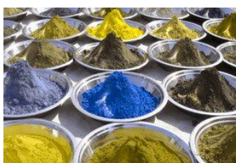
A form of severe red/green CVD (Deutanopia)