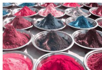
Tritanopia (severe loss of blue vision)

People with red or green deficiencies will see the world in a similar way to each other because red and green are very close together on the light spectrum. Most people think red/green colour blind people confuse just red and green. This is not the case at all - red/green colour blind people have problems with colours right across the spectrum, particularly reds, greens, oranges, browns and greys, as the images above demonstrate. Blues and purples can be confused because of the red tones in purple and people with a red vision deficiency will find it difficult to distinguish dark colours and can readily confuse a deep red with black!