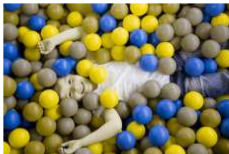
Red/green colour blindness