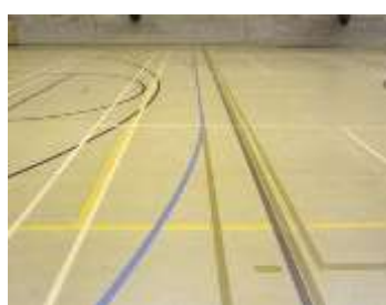
Red/green colour blindness