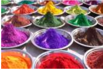
Normal colour vision

Red/green deficiencies are very common but blue deficiency and total colour blindness (where everything is seen in shades of grey) are extremely rare.