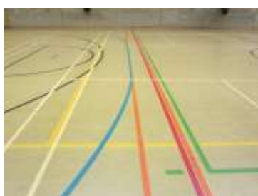
Normal colour vision

Playing sport also becomes more sophisticated and competitive but many line markings in school sports halls are unintelligible to colour blind students