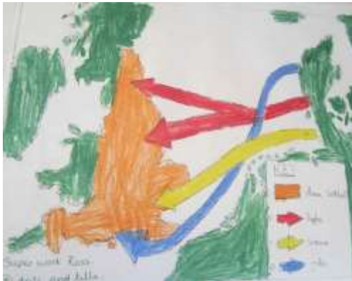
Normal colour vision