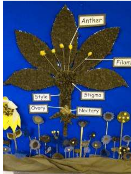
Red/green colour blindness