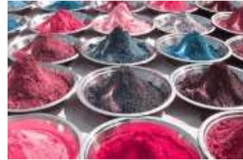
Tritanopia (severe loss of blue vision)

Colour blindness can sometimes be acquired as a result of other conditions such as diabetes and multiple sclerosis.