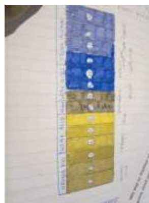
Red/green colour blindness

Some subjects areas of science can be completely misunderstood without proper support – e.g. light waves/chemical reactions. Universal indicator, litmus paper and other chemical indicators are very difficult for colour blind students to understand. Information in diagrams can be easily missed.