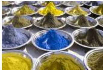
A form of severe red/green CVD (Deuteranopia)