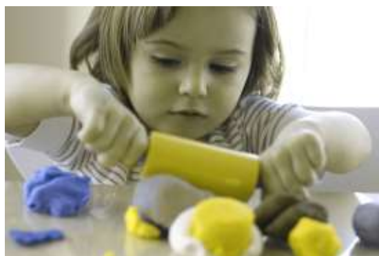
Severe red/green colour blindness

Modern teaching methods heavily rely upon the use of colour to teach, highlight, warn and explain, but what if the colours we describe are not the same for the children we are teaching?