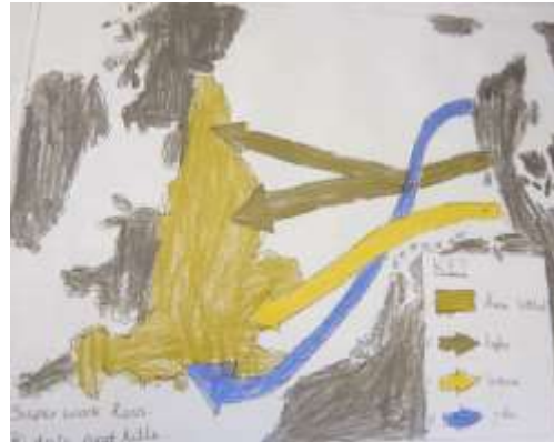
Red/green colour blindness

Older children will be less likely to make mistakes in choosing colours for themselves as they have had more time to learn the very subtle differences in shading which help them to identify different colours. They will also have had more time to hone coping techniques such as copying other children in colour situations. However, the older the child becomes the more they will be exposed to situations where they will be expected to interpret colour accurately, especially in school.