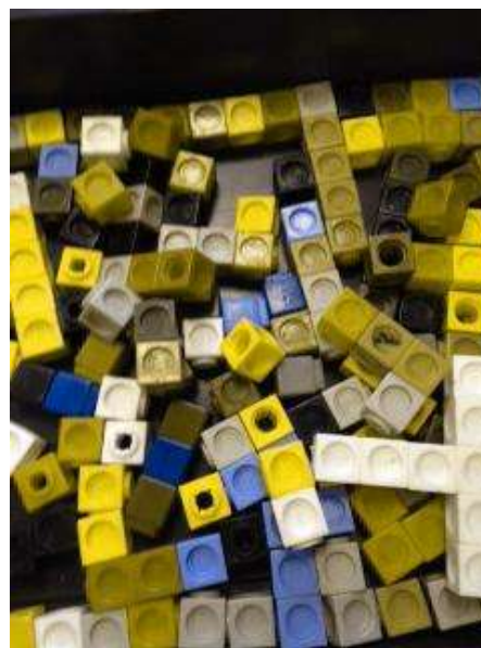
Red/green colour blindness