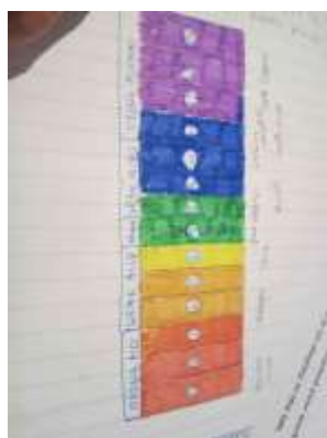
Normal colour vision

Colour becomes an even more important element in the teaching of most subjects. New subjects are introduced and colour blind students might need extra support with coding software, when interpreting financial information in Business Studies, understanding maps and charts in geography and so on.