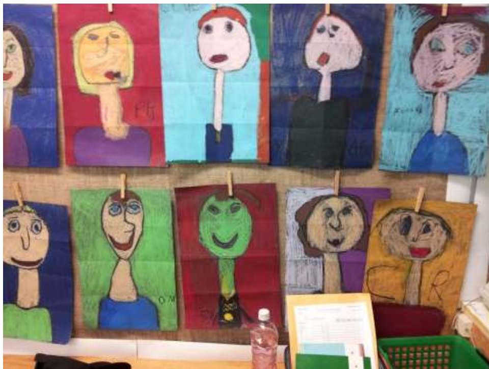
Spot the self-portrait by the colour blind student