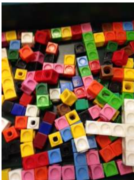
Normal colour vision