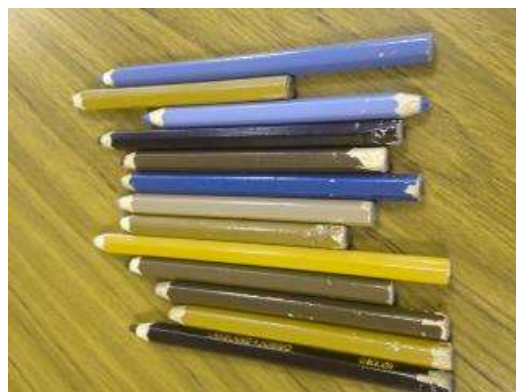
Red/green colour blindness