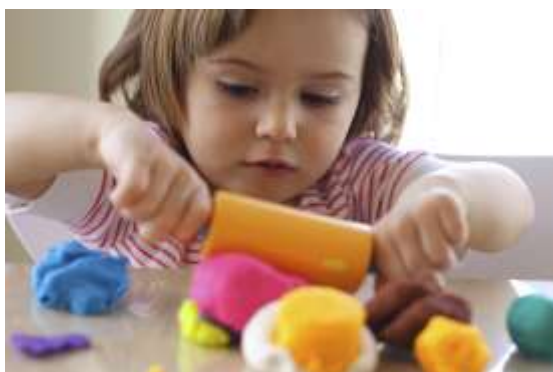
Normal colour vision

Statistically speaking there will be at least colour blind child in every classroom.