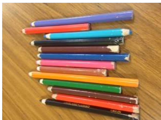
Normal colour vision

Children with CVD are not usually children with seemingly obvious learning difficulties – they are much more likely to be the quiet child trying not to draw attention to themselves, often those who have to be encouraged into answering questions in front of the class.